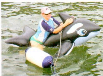
Sai Kung wildlife (above) and raft-up (below)

Next year we will have to get it on the club calendar and be a little better organized so that more boats can join the fun.