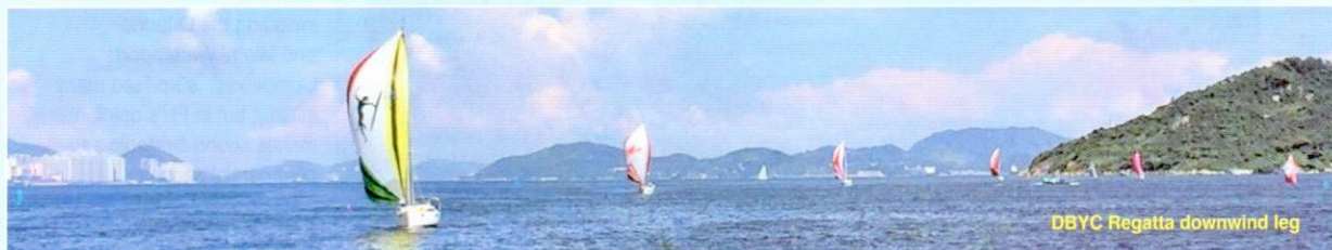
DBYC Regatta downwind leg

At a recent Stammtisch, we tried out the